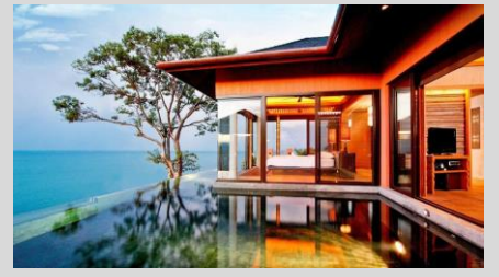
Phuket SRI PANWA PHUKET ★★★★★★