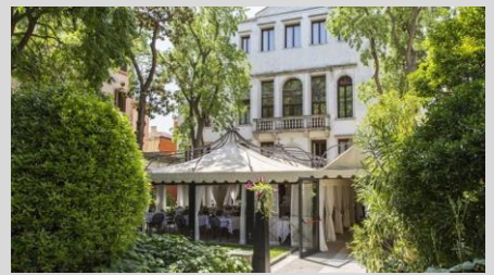
Venice GRAND HOTEL DEI DOGI ★★★★★★

For more information, please contact: ORIENT ESCAPE TRAVEL GROUP