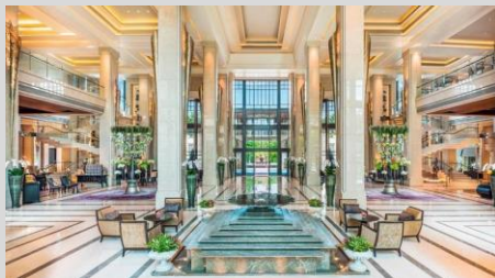
Bangkok SIAM KEMPINSKI HOTEL BANGKOK ★★★★★