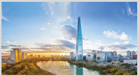
Seoul SIGNIEL SEOUL ★★★★★★