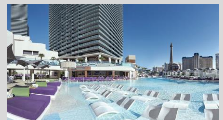
Las Vegas THE COSMOPOLITAN OF LAS VEGAS ★★★★★

For more information, please contact: ORIENT ESCAPE TRAVEL GROUP