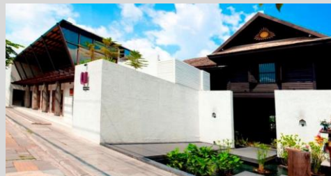
Chiang Mai U CHIANG MAI HOTEL ★★★★★