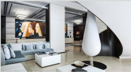
New York City THE LANGHAM, NEW YORK, FIFTH AVENUE ★★★★★★