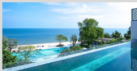
Hua Hin BABA BEACH CLUB HUA HIN ★★★★★