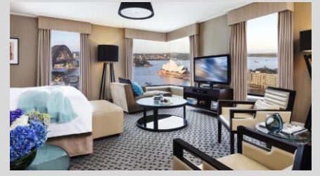
Sydney FOUR SEASONS HOTEL SYDNEY ★★★★★★