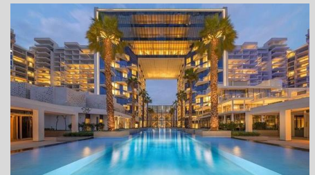
Dubai FIVE PALM JUMEIRAH DUBAI ★★★★★