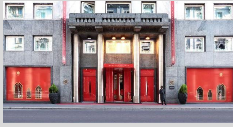
Milan PALAZZO MATTEOTTI ★★★★★★