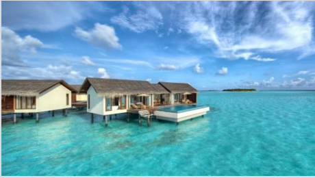
Maldives THE RESIDENCE MALDIVES ★★★★★★