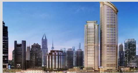
Shanghai THE MIDDLE HOUSE ★★★★★★