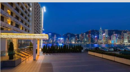
Hong Kong MARCO POLO HONGKONG HOTEL ★★★★★