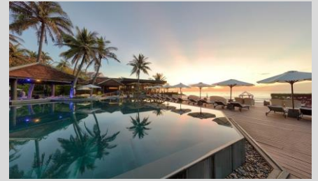
Mui Ne ANANTARA MUI NE RESORT ★★★★★★