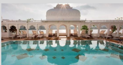
Udaipur TAJ LAKE PALACE ★★★★★★