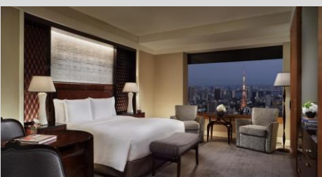
Tokyo THE RITZ-CARLTON TOKYO ★★★★★★