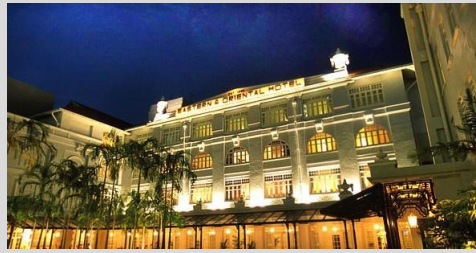
Penang EASTERN & ORIENTAL HOTEL ★★★★★★